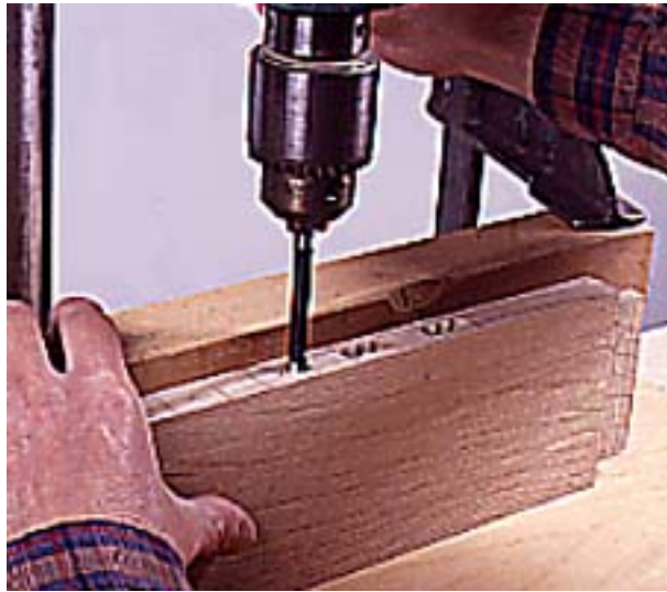
4--Cut the slat mortises in the rails using a drill press to remove most of the waste and a sharp chisel to finish the cuts.

then bore overlapping 3/8-in.-dia. holes to remove most of the waste (Photo 4). Complete the mortises by smoothing the walls and squaring the ends with a sharp chisel.