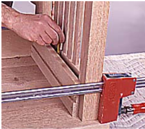
18--Center the base over the top and mark the fastener holes. Then bore pilot holes in the top and attach the base.