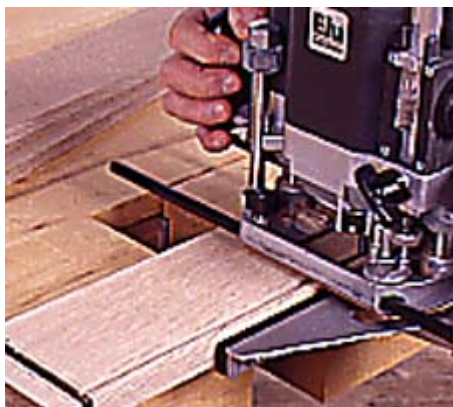
table to cut both sides of the dovetails on the ends of each drawer side.

15--Cut a dado between the dovetail slots on the drawer face for the bottom panel. Cut matching dados in the drawer sides.