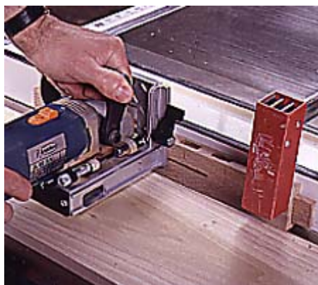
5--Clamp the bottom shelf securely to a workbench. Then use a plate joiner to cut joining slots in both ends of the shelf.

Apply glue to the rail tenons and leg mortises, then assemble the table side. Clamp the joints tight, then compare opposite diagonal measurements to be sure that the assembly is square (Photo 8).