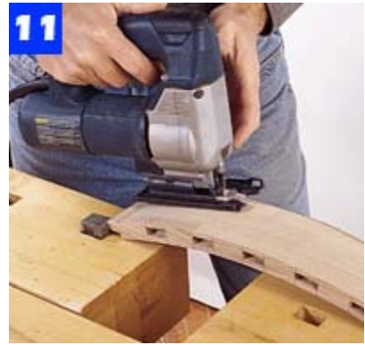
Use a template to lay out the arched profile of the upper back rail. Then, cut to the line with a sabre saw and smooth.

Mark the shoulders on the top and bottom edges of the curved back rails and use a small backsaw to make the cuts (Photo 12). First, make the cuts into the endgrain of the tenon. Then finish the shoulder by cutting across the grain.