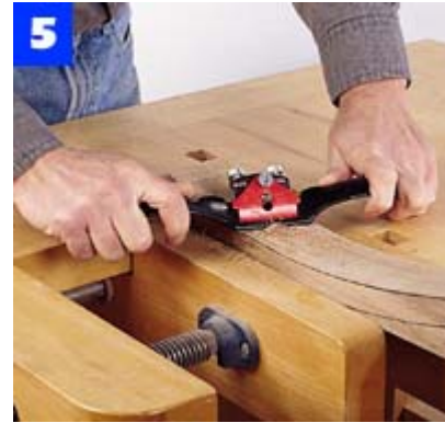
Use a spokeshave to smooth the inside curve of the back rail, and then cut and smooth the outer curve.

Cut one surface of each tenon with the ramp angled down toward the dado blade (Photo 6). Then, secure the ramp in the opposite direction and readjust the blade height for the opposite side of each tenon (Photo 7). If you're using the holddown clamp, you'll need to remount it. Then, use the miter gauge without the jig to make the angled cuts for the top and bottom shoulders of the side rails (Photo 8). Cut strips for the side and back slats. Crosscut the slats to finished length, and set them aside.