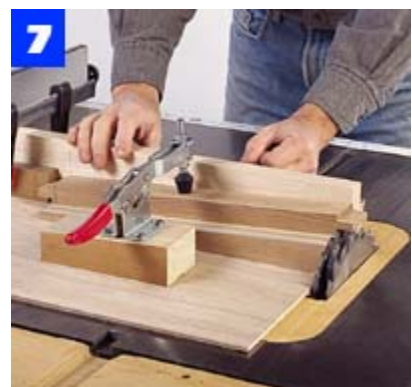
When cutting the opposite tenon faces on the rails, reverse the ramp on the jig and readjust the dado blade height.