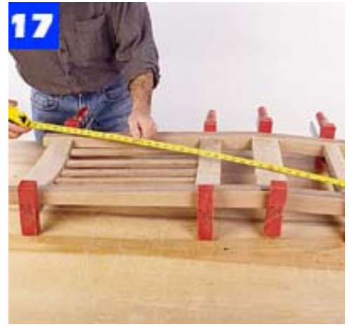
Join the back rail and slats to the legs. Apply the glue sparingly, clamp, and check that the diagonals are equal.

Once the glue has set on the subassemblies, complete the chair frame by joining the side rails to the back-leg assembly. Spread glue on the mating surfaces and position the joints. Apply clamps to pull the joints tight. Set the chair upright on a flat worktable to be sure that all four legs sit evenly (Photo 18). Adjust the clamps and joints, if necessary, until any rocking is eliminated.