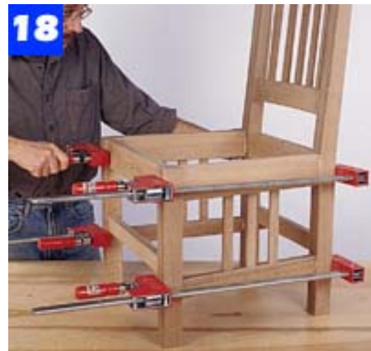
Join the back subassembly to the front-leg/side-rail assembly. Work on a flat surface so the legs remain even.

Finally, attach the finished slip seats to the frames with screws installed through the corner blocks into the underside of each seat.