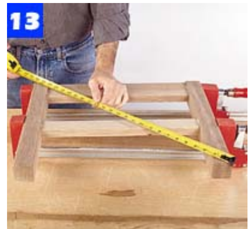
Join the front rails to the legs, and clamp. Compare opposite diagonal measurements to check for square.