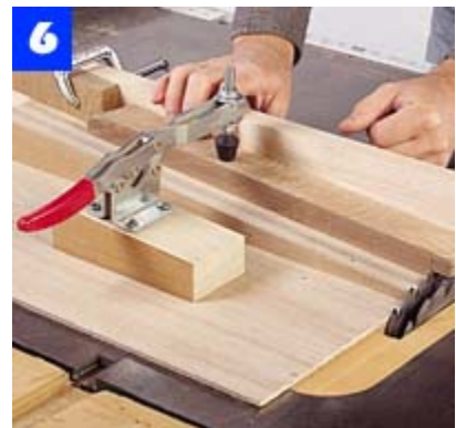
To cut the angled tenons on the side rails, support the stock in a table saw jig that holds the work at a 4° angle.

Install a 5/16-in.-dia. bit in the drill press and bore slightly overlapping holes to remove most of the waste from the mortises in both the curved and straight rails (Photo 9). Then, use a sharp chisel to pare the walls and square the ends of the mortises (Photo 10). Test a slat in each mortise--the fit should be snug. Make another template for the arched shape of the top back rail and use the template to trace the shape onto the workpiece. Use a sabre saw to cut the profile (Photo 11).