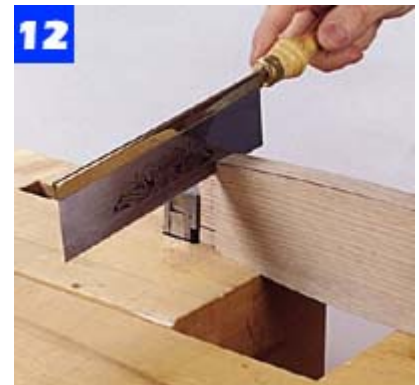
Cut the shoulders of the curved back rail tenons with a small backsaw. First cut in from the end, then across the grain.

Spread glue on the tenons of the back rails and in the matching mortises in the back legs. Join the rails to the legs, clamp and compare opposite diagonal measurements (Photo 17).